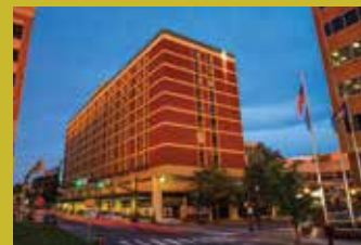
The Hotel Lancaster