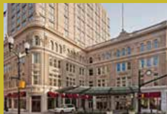
Lancaster Marriott at Penn Square

Both of our conference hotels are located in downtown Lancaster within a short walk to the Ware Center, our host for MAPAM. In addition to your discounted conference rates, the hotels are extending those rates before and after the conference so you can enjoy all the amazing attractions, shopping, history, and culture Lancaster County has to offer.